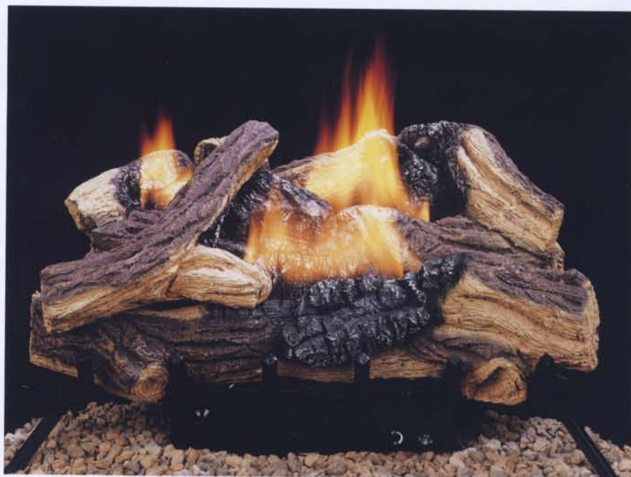
Golden Oak Vent-Free Gas Log Heaters