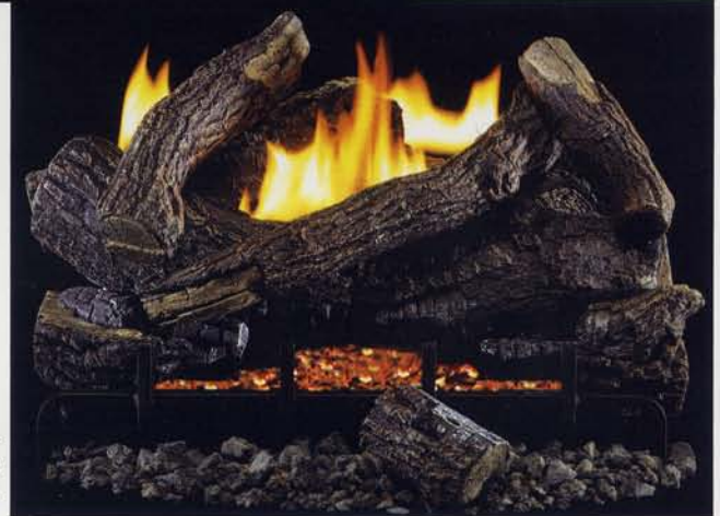
The Scarlet Oak (VCC) - Concrete Vent-Free Gas Log Heater.