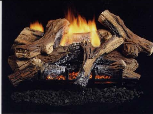
The Scarlet Oak (VGC) - Vent-Free Gas Log Heater.

This appearance of glowing coals is achieved through the use of Platinum Bright Embers or Ceremat. Platinum Bright Embers give a bright glow appearing as hot coals, while Ceremat provides a glow appearing as a flickering ember bed. Not only does the Scarlet Oak possess this unique technology for its glowing coals, it also boasts a triple burner for greater fire and light: two burners of bright yellow flame, plus the front burner for the glowing ember bed.