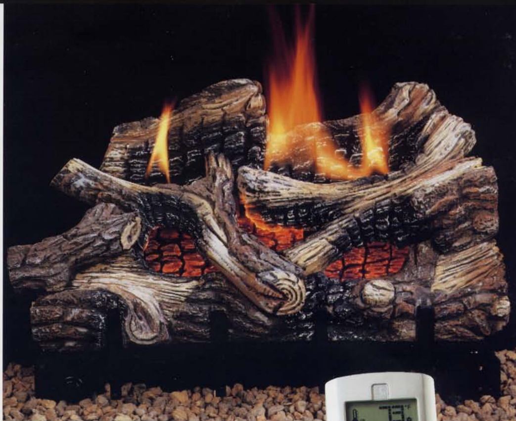
Blaze n' Glow "Pro" Logs combine a unique slanted burner with turn-down allowing for 60% heat reduction. Also includes Proflame remote control.