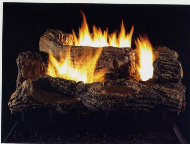
Multi-Sided Vent-Free Gas Log Heaters

Vanguard's Multi-Sided Vent-Free Gas Log Heater features remote "ready" controls, abundant yellow flames from a dual burner, plus a beautifully styled multi-log five-piece design.